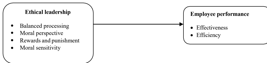
Figure 1: Theoretical model.

them, that is, if ethical leadership is practiced does it affect employee performance? Dimensions of employee performance (that is, effectiveness and efficiency) were not studied. The theoretical framework for the study can be seen from the following schematic diagram (Figure 1).